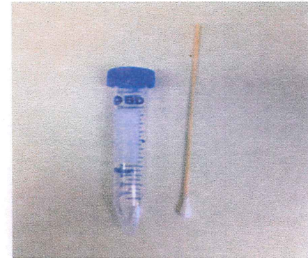
Wet Prep (saline provide by lab)