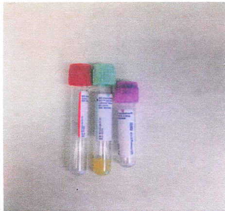
Body Fluids other Than CSF